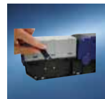
BlueChip™ for convenient updates