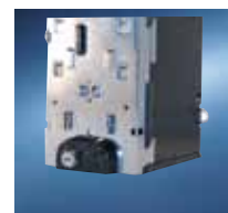
Locking cash vault reduces driver temptation