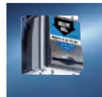
Pulsing Blue LED lights attract consumers